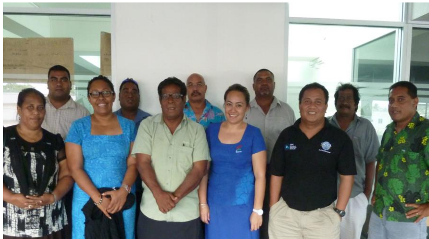
Abaiang Whole of Island Planning Team (Absent from the photo: SPC/GIZ, SPC GGCA: PSIS, USP: GCCA)