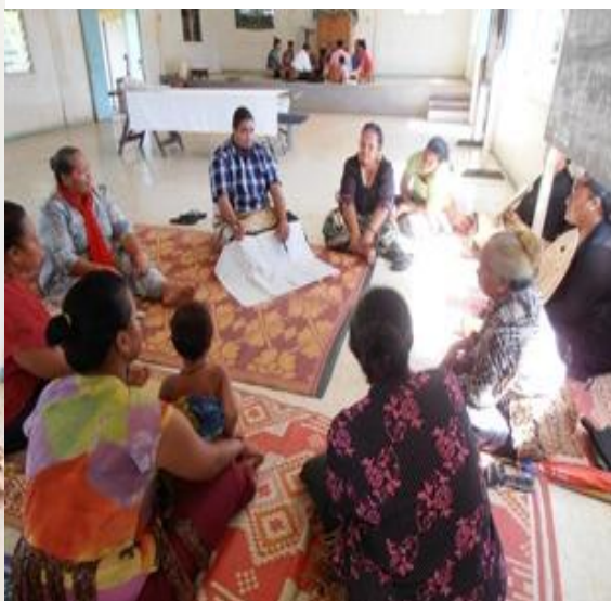
Plates 1b Women Group during PRA