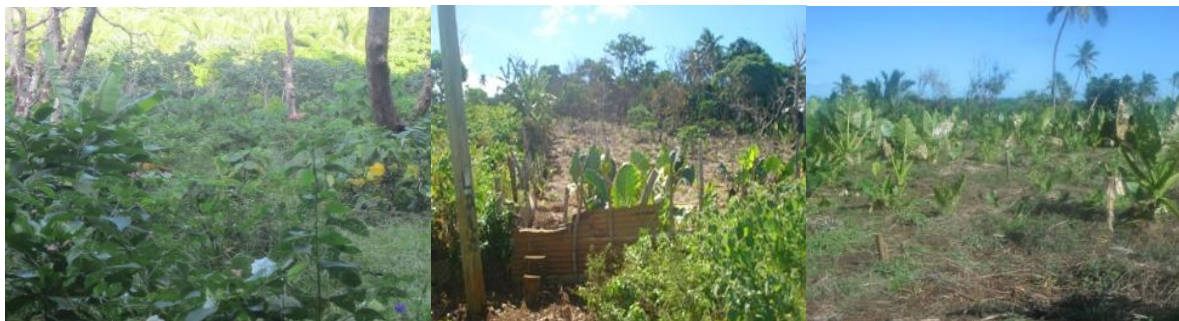
Plate 2a. Houma

Plates 2a, 2b, and 2c also show the exposures of the sites to climate changes. The photos show that all are exposed to potential impacts of climate variability with Houma and Kolonga exposure to strong winds and Tefisi exposure to soil erosion from high intensive rainfall.