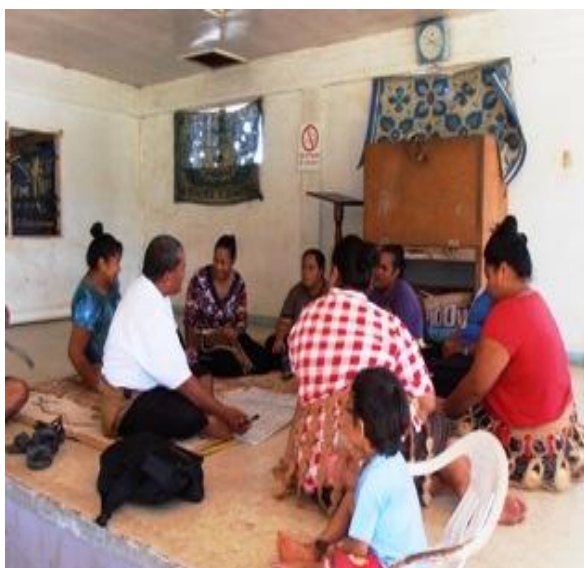
Plates 1a Youth Group during PRA