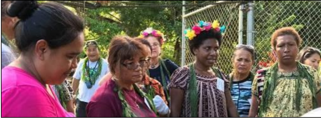
Women participating in the “Learning Exchange: Women leading climate action in Melanesia, Micronesia, and Alaska” organised by The Nature Conservancy in Yap, 13-16 June 2018