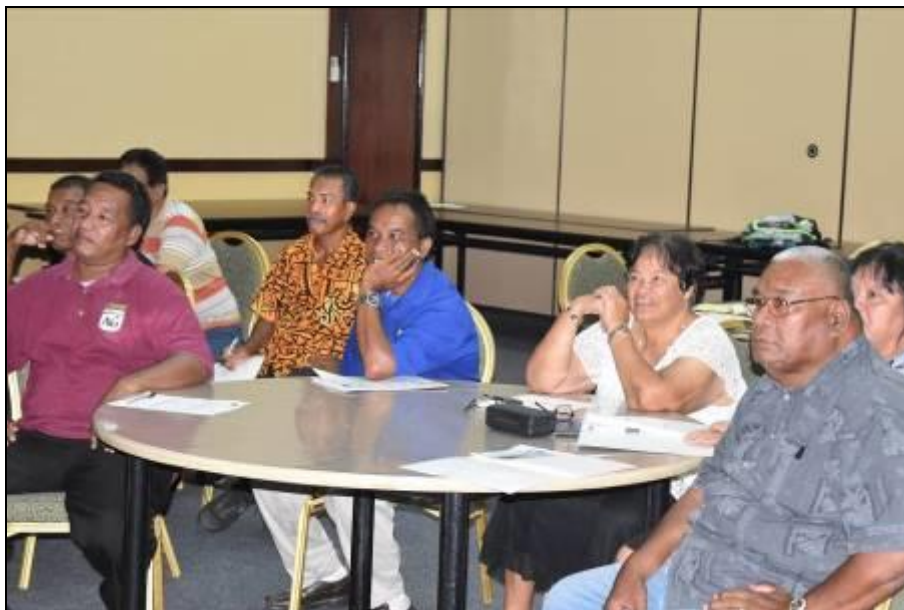
Mayor and some of the Island Council from Ailuk, RMI, listening to a presentation on rights-based approaches, 7 th June 2018