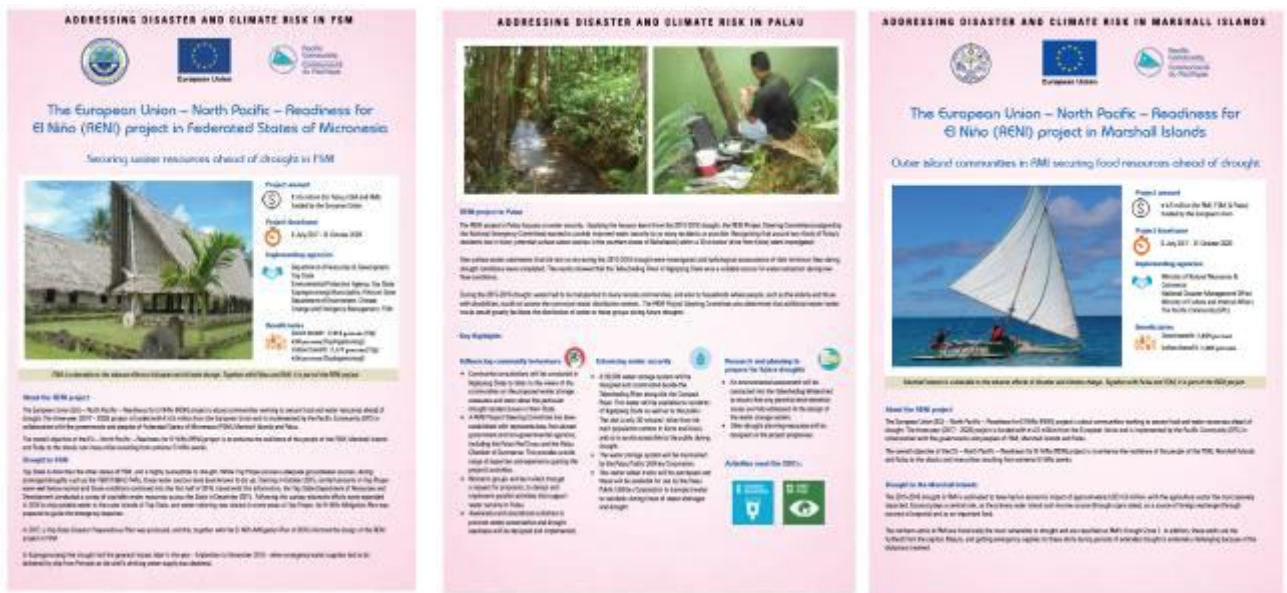
National project fact sheets