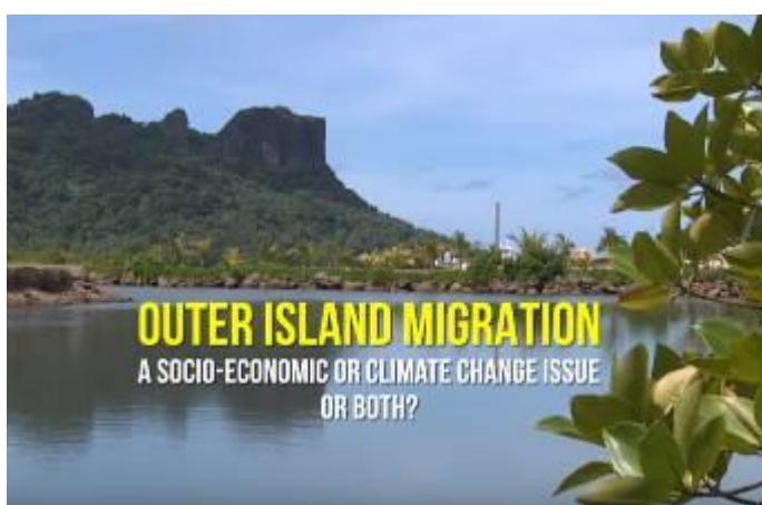
Opening screen of one of the video products