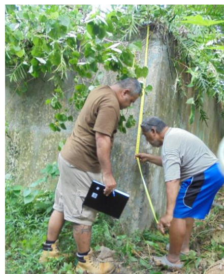
Discussions with community members and assessments of existing water storage facilities have been conducted in Yap Proper, FSM