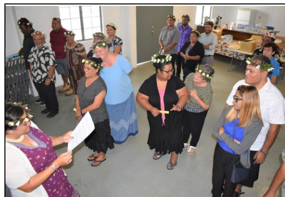
Power walk at CRGA in June 2018 (l) and at RENI Steering Committee Meeting in April 2018 (r).

(During a power walk activity, participants are each assigned a character role in the community. Everyone starts out in a straight line, and then moves forward or back as a number of different rights in the community are read out, e.g. “I can influence community decisions” or “I can apply for a bank loan”. At the end of the activity there is a discussion as to which groups are more disadvantaged in the community).